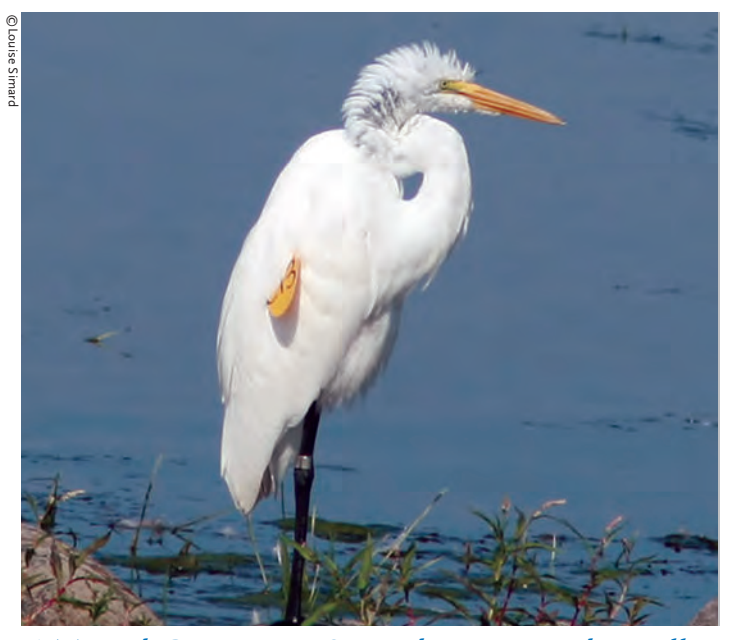
A Tagged Great Egret Spotted at Riviére des Mille Îles, Saint-François, Laval, Quebec

protection and will help raise public awareness and understanding of the importance of actively conserving wildlife. Elbin asks that if you see any of these wing-tagged birds this spring, please note the tag code, take a photo if possible, and contact her at 212-691-7483 or <u>selbin@nycaudubon.org</u>.