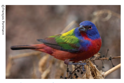
Male Painted Bunting, a Rare Visitor to Brooklyn's Prospect Park this Winter

Looking forward to the field season, we will be undertaking some new projects under the umbrella of our two main programmatic