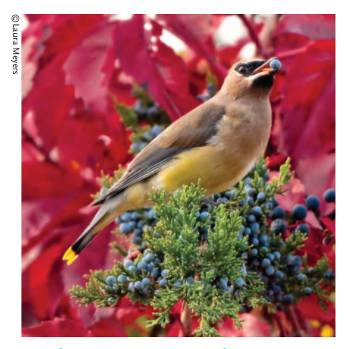
Cedar Waxwing Feeding on Native Eastern Redcedar

Not surprisingly, gray catbirds were the most common species recorded: catbirds definitely rule from the "catbird seat"