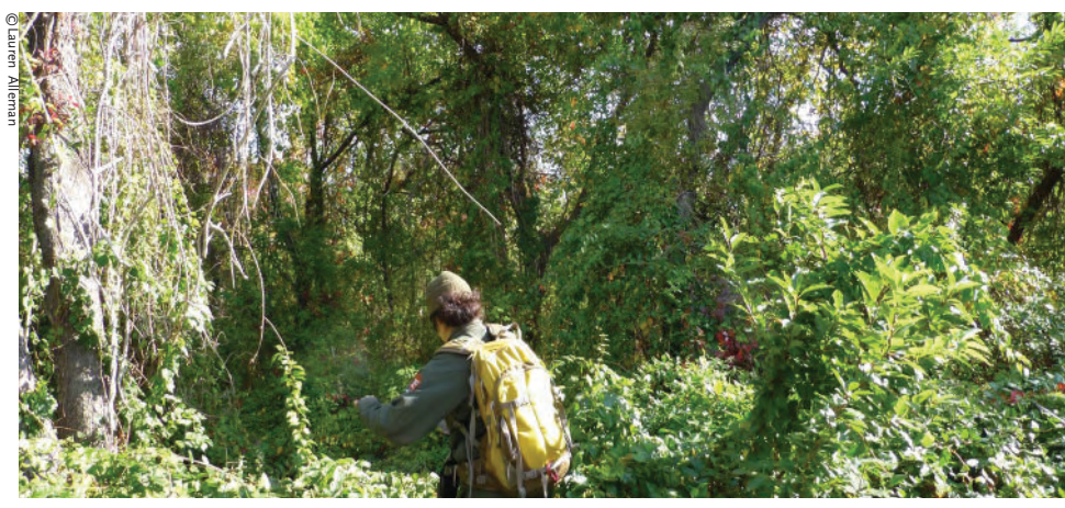
The NPS' Hanem Abouelezz Surveys a Future Restoration Area

The restoration project is now under way. Invasive plant removal began in early December 2015 and will continue in phases for the next two years. NPS has hired contractors that will use a combination of mechanical and chemical control methods, in accordance with their regional invasive plant control guidelines. After invasive plants are removed, the team will plant approximately 30,000 native trees and shrubs across the 14 acres, relying on volunteers to help with the