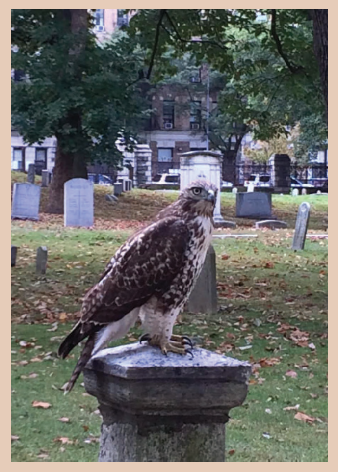
Red-Tailed Hawk at Trinity Church Cemetery

If you visit the Trinity Church Cemetery and Mausoleum, be sure to also take in the large murals of birds painted by local artists found on the eastern and northern boundaries of the cemetery—one on Amsterdam Avenue and another on 155th Street. They too constitute an appropriate memorial to Audubon.